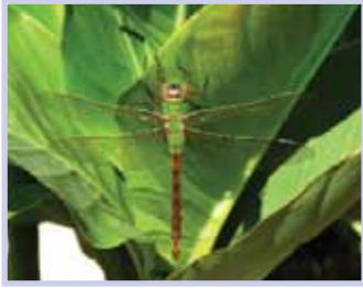
While on a trip to Kawasaki (Motorcycles) with my husband I saw this Dragonfly on a nearby plant. I quickly grabbed the only camera in the truck we had just purchased and luckily the battery had enough charge to take just three photos. It shows you always need to be prepared...